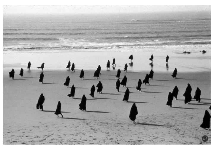
Shirin Neshat, Rapture (still), 1999. © Shirin Neshat. Photo by Larry Barns. Courtesy of Galerie Jérôme de Noirmont, Paris.